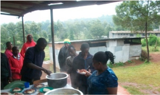
Meals being served at the center

The kitchen and serving area is still a temporary structure as the center tries to raise funds to put up a proper facility. Despite that we are able to offer our students proper meals. Cooking is mainly done with firewood and saw dust.