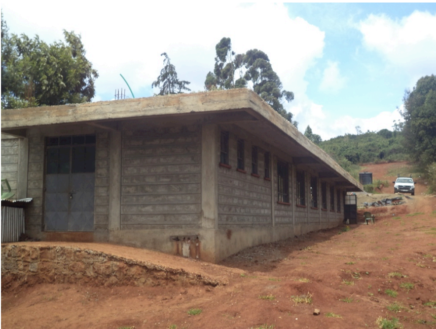
Construction of the first dormitory

We managed to finalize the construction of our first dorm in May. We are very grateful for the donors who supported us in the construction of this dorm. Though it is still in need of some finishing touches –painting of the inner and outer walls and tiling it- we are able to use it. This dorm offers space to 48 students and is at the moment being used by our female students. The second dorm will be constructed for the use of our male students. We currently are in search for donors who want to support us in the construction of this second dorm.