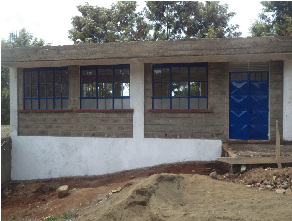
Our first classroom

The recession in the West has a negative effect on Marianne Center as well. Our plans for the mentally disabled students are very promising, though this does require investments for activities like the construction and the set up of income generating activities. These activities will largely contribute to the financial independency of Marianne Center. Due to the fact that funds are released in low amounts and are hard to find, our goal will most likely be reached at a much later stage. Even so, we are still able to offer our students the programmes, support and care they need.