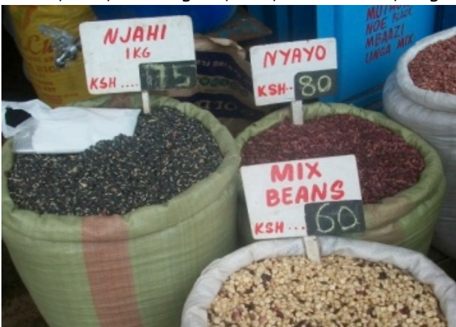
Food items from Redeem Cereal Shop

The food items that the center receives from Redeem Cereal Shop include maize, maize flour, beans, rice, cooking fat, salt, wheat flour, sugar and green grams.