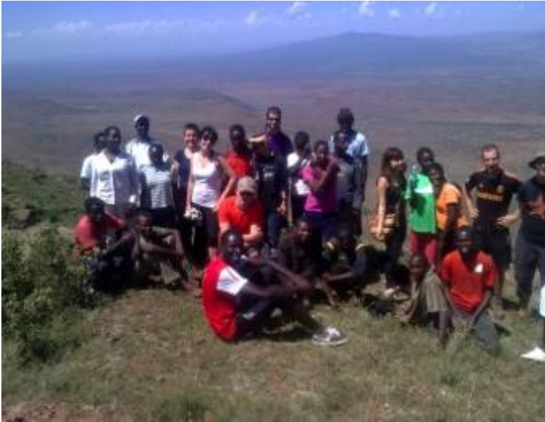
The team of volunteers

our plot for growing maize and preparing the parking area for our visitors. The volunteers were of great help and joy to all of us!