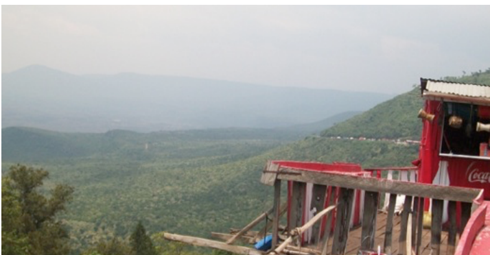
Great Rift Valley View Point

The nature walks are a physical therapy necessary for the students who are mentally challenged because they help to relax mind and body. Walking helps some of them firm their body muscles and exercise the joints. Students are exposed to different environments apart from the one they are used to at the center complex. It also helps them to learn the various tree species and their properties. On some of the trips, they pass through farmlands seeing different farming practices in the area. They are able to appreciate nature more and begin to understand the need to conserve the environment.