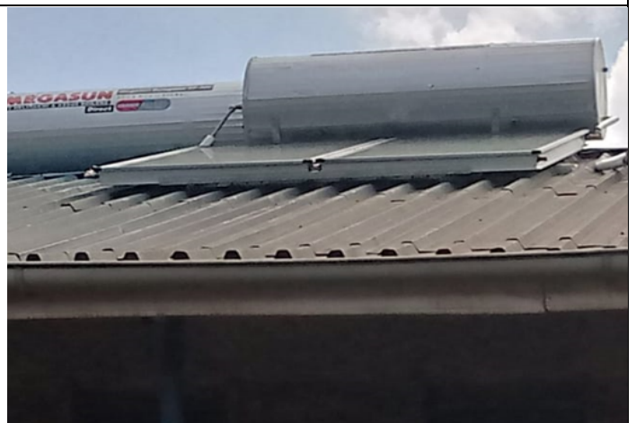
Solar boilers placed by Our Energy Foundation