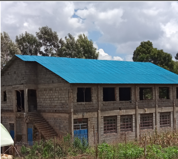
The roof has been placed