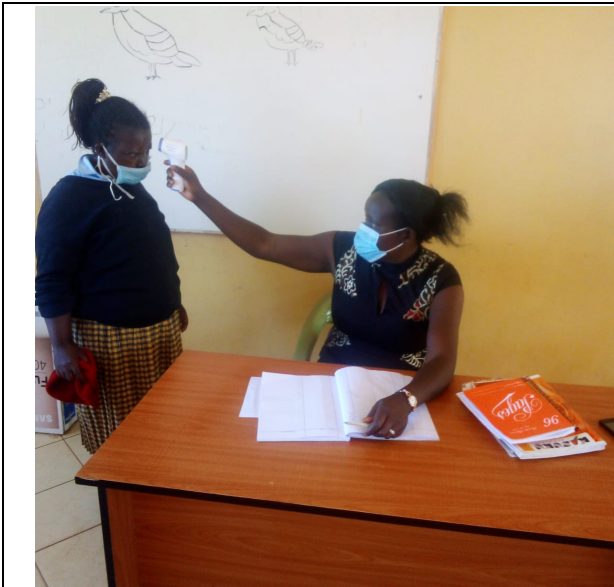
Covid measure at MC