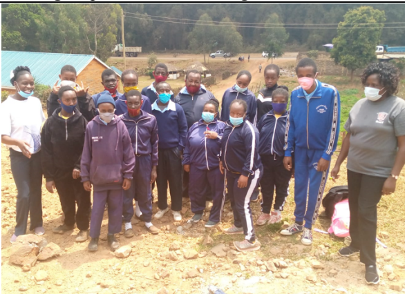
Our students and teachers