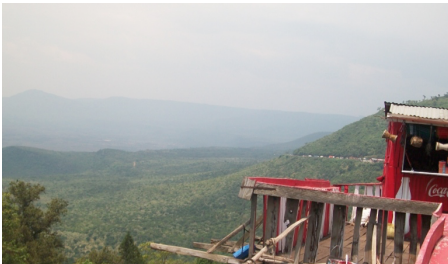
Great Rift Valley View Point

The nature walks are a physical therapy necessary for the students who are mentally challenged because they help to relax mind and body. Walking helps some of them firm their body muscles and exercise the joints. Students are exposed to different environments apart from the one they are used to at the center complex. It also helps them to learn the various tree species and their properties. On some of the trips, they pass through farmlands seeing different farming practices in the area. They are able to appreciate nature more and begin to understand the need to conserve the environment.