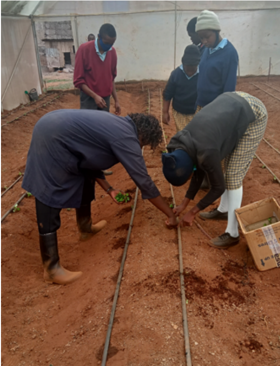
Planting crops in our renovated greenhouse