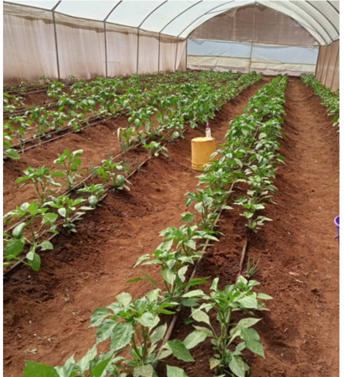
Growing crops in our greenhouse