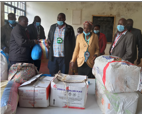
Donation to Marianne Center